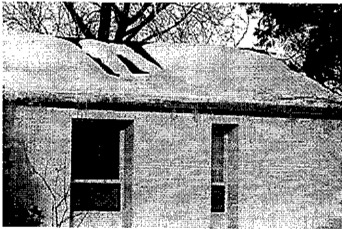
Photograph 1. A single-story house with an ice dam. The areas without snow are the points of heat loss.

Photograph 1 shows a single story house with an ice dam. The points of heat loss can be clearly seen as those areas with no snow. The ceiling below this area needs to be examined for air leakage, missing or inadequate insulation, leaky or poorly insulated ductwork, and the termination of a kitchen or bathroom exhaust into the attic space.